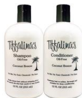
HCG-Safe Shampoo & Conditioner