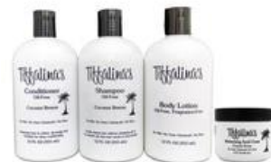
HCG-Safe Personal Care