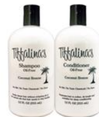
HCG-Safe Hair Care

We are particularly averse to those modern cosmetics, which contain hormones, as any interference with endocrine regulations during treatment must be absolutely avoided. Many women whose skin has in the course of years become adjusted to the use of fat containing cosmetics find that their skin gets dry as soon as they stop using them. In such cases we permit the use of plain mineral oil, which has no nutritional value. On the other hand, mineral oil should not be used in preparing the food, first because of its undesirable laxative quality, and second because it absorbs some fat-soluble vitamins, which are then lost in the stool. We do permit the use of lipstick, powder and such lotions as are entirely free of fatty substances. We also allow brilliantine to be used on the hair, but it must not be rubbed into the scalp. Obviously, sun-tan oil is prohibited.