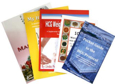
HCG Diet Books

PoundsandInchesLost.com offers everything you need for the HCG diet, including HCG Diet Drops. Feel free to stop by our site at www.PoundsandInchesLost.com today! Remember to use the discount code below for extra savings.